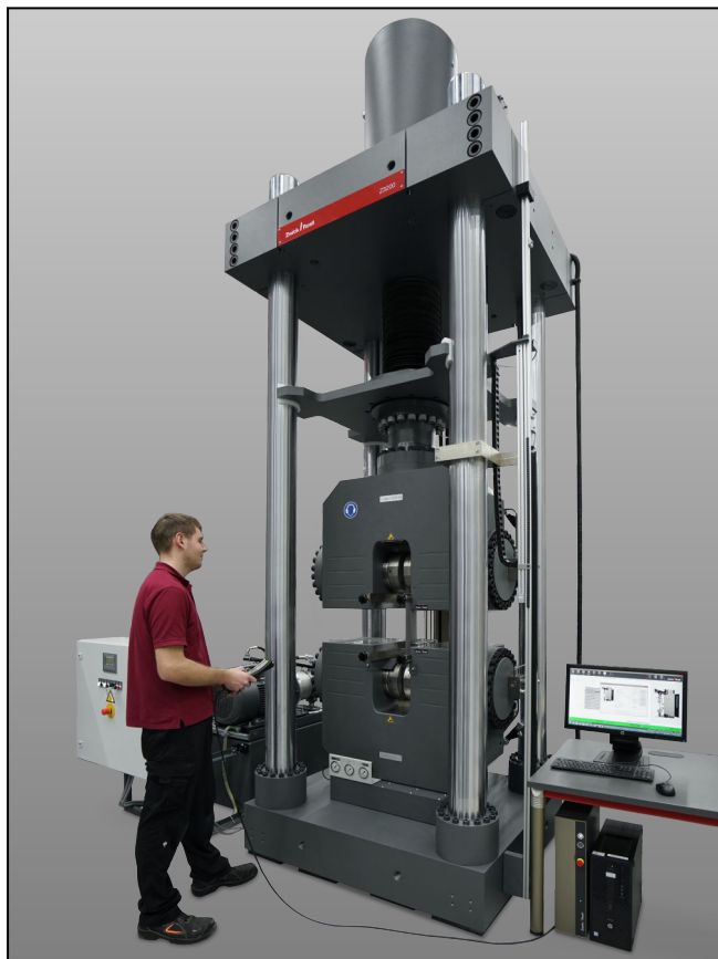
ZwickRoell Z3000H with hydraulic grips